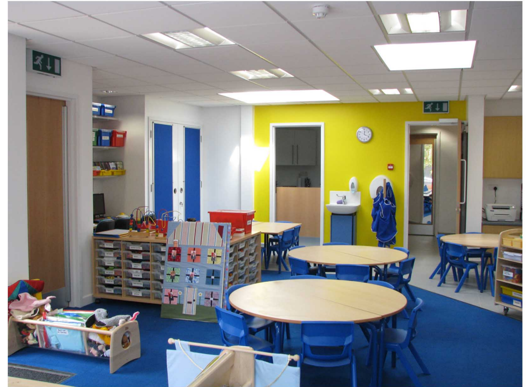
Project partnered with and run on behalf of The Seaman Partnership Ltd